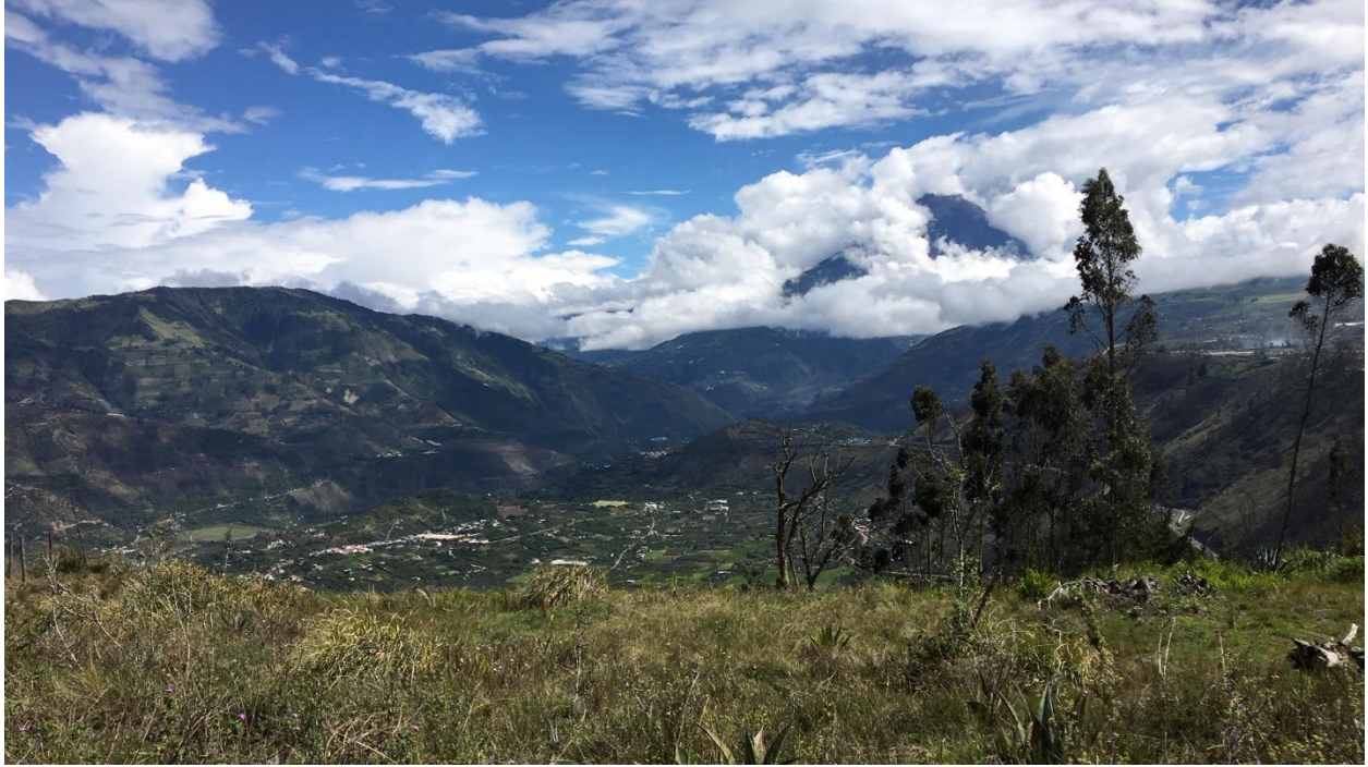
Ecuador by day...