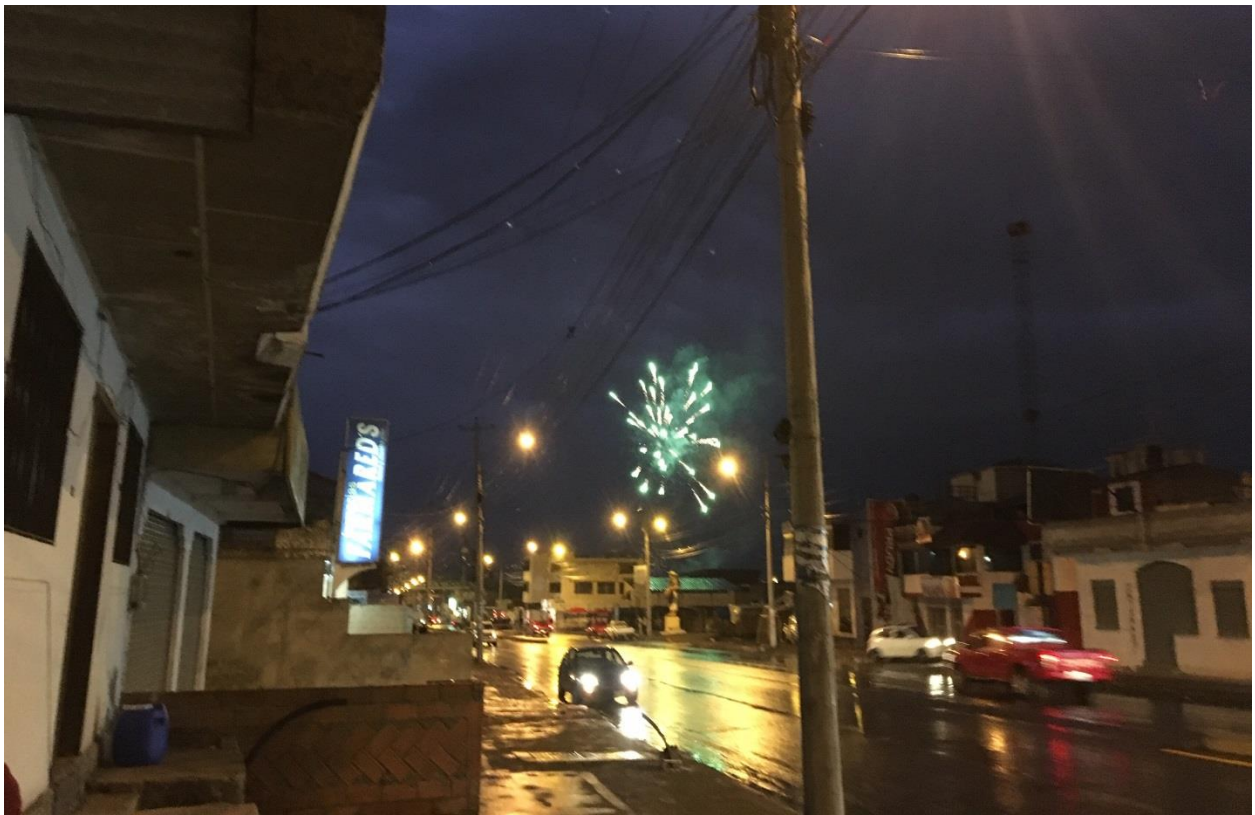
Salasaka by night...