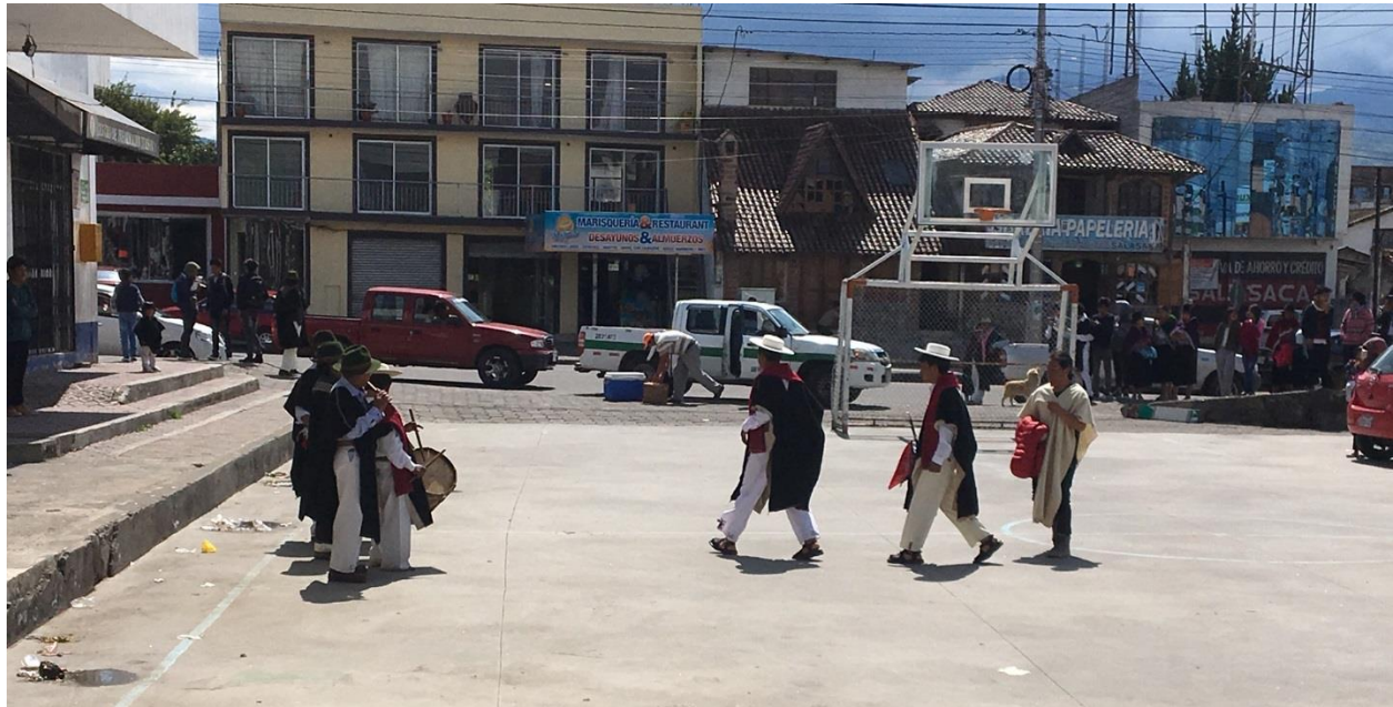
Celebrating the "Captain" Festival in Salasaka...