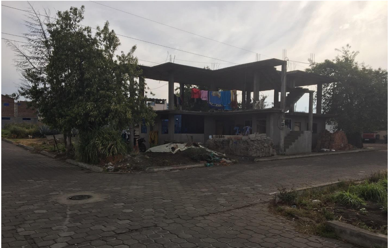
Laundry day in Salasaka above.